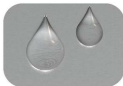
WATER RESISTANT FRAME ALUMINUM - STAINLESS STEEL